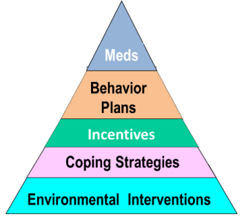
PWS Intervention Pyramid

Undiagnosed medical problems can also increase stress and cause behavior changes. Not every new behavior signals a psychiatric diagnosis, but all new problematic behaviors should be evaluated by a physician. The approach to improving behavior begins at the bottom of the PWS Intervention Pyramid.